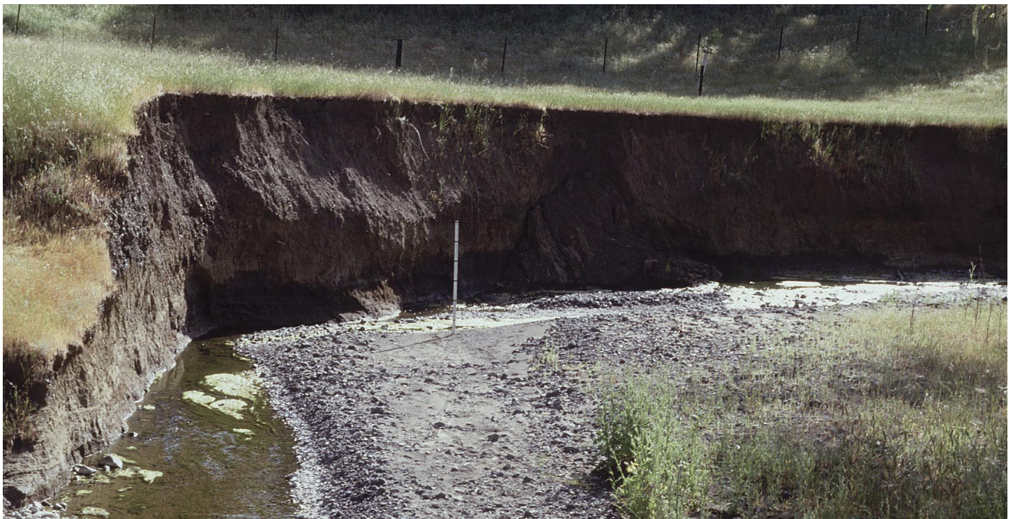
Figure 1. Site 1—Unstable area.

Source sites. Sites that receive “yes” responses to all four criteria are termed “source sites.” These are sites with sediment delivery that can be addressed and controlled (see fig. 2 and appendix C).