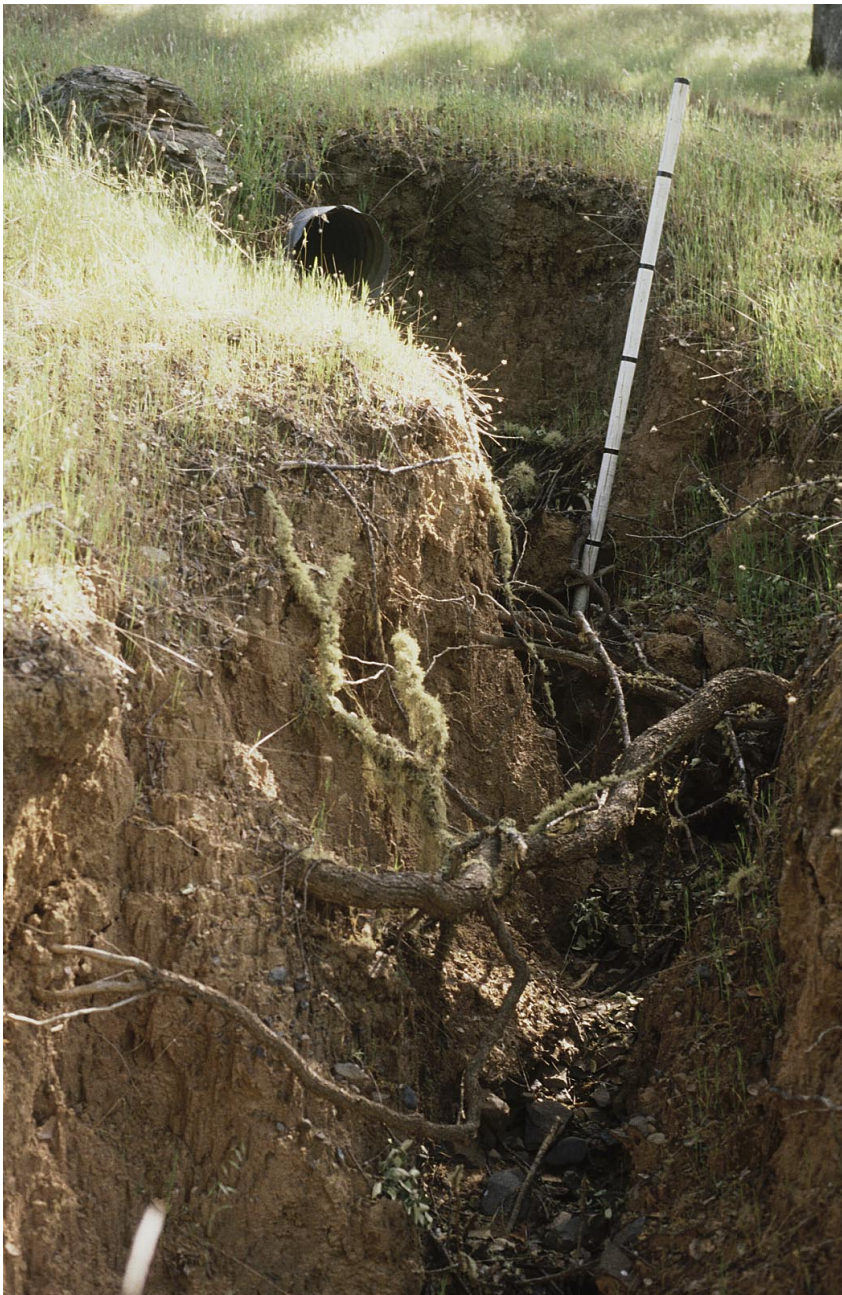
Figure 2. Site 2—Source site.

Site selection criteria. Criteria used to select and differentiate sites for baseline monitoring. To be a source site, the potential sediment from a site must be (1) deliverable to a surface watercourse, (2) management induced, (3) reasonably responsive to mitigation, and (4) greater than the volume threshold.