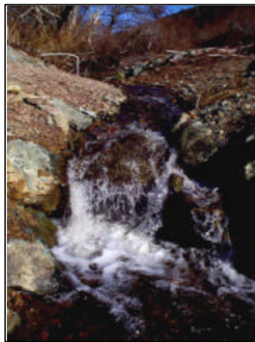
Flow over Apex Boulder