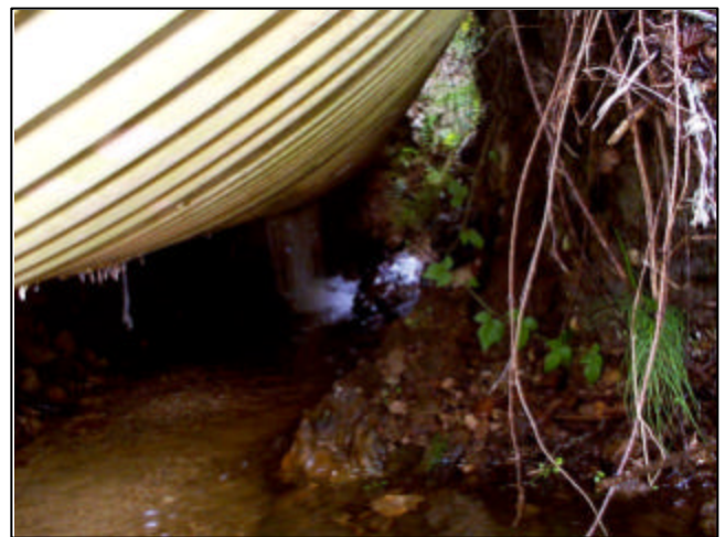
Failed Culvert and Fish Impediment